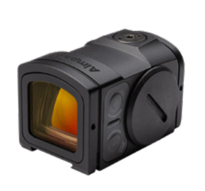
AIMPOINT ACRO P2