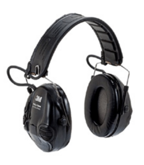
3M PELTOR TACTICAL SPORT