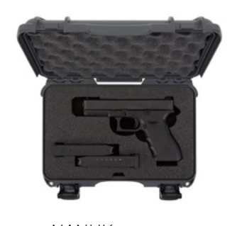
NANUK 909 GLOCK