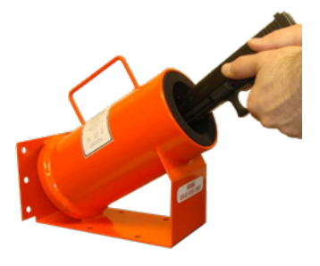
BOSIK TECHNOLOGIES PORTABLE BULLET TRAP