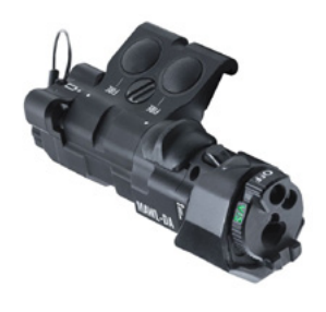
BE MEYERS MAWL