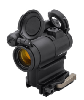
AIMPOINT COMP M5