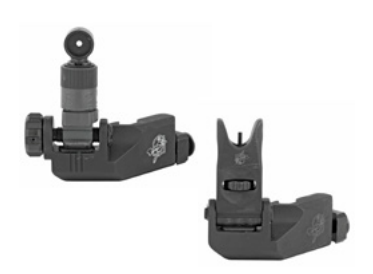
KNIGHTS ARMAMENT 45 DEGREE IRON SIGHTS