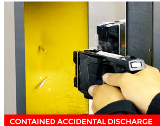
CONTAINED ACCIDENTAL DISCHARGE

CEW Users can conduct daily function tests, scheduled downloads or test malfunctioning cartridges safely and effectively.