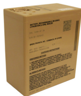
BREN-TRONICS AH LOW TEMP RECHARGABLE LITHION BATTERY