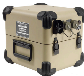
BREN-TRONICS U BASED PORTABLE POWER SYSTEM