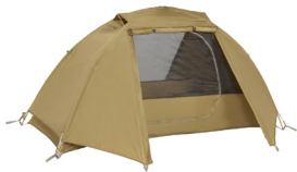
KELTY 1-MAN FIELD TENT