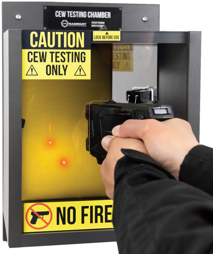
RAMPART GEN 2 CEW TESTING CHAMBER

THE CHAMBER IS INDEPENDENTLY CERTIFIED FOR: