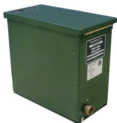
BREN-TRONICS VEHICLE MOUNTED CHARGER