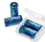
ASP LITHIUM CR123A BATTERIES