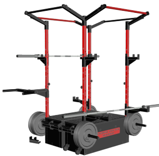
BEAVER FIT DUAL RACK GYM BOX