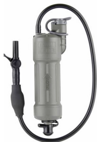
CAMELBAK M.A.P.S.™ PURIFICATION SYSTEM