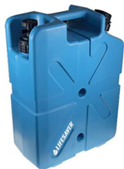
LIFESAVER 18.5L JERRYCAN