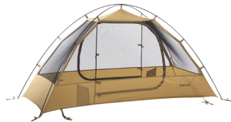
KELTY 2-MAN FIELD TENT