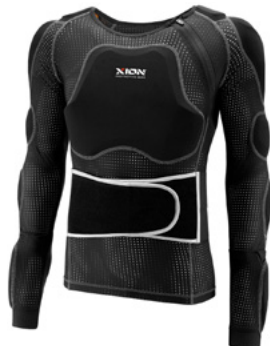
XION CRC JACKET