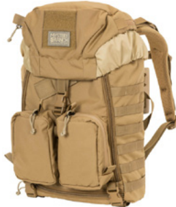
MYSTERY RANCH RATS