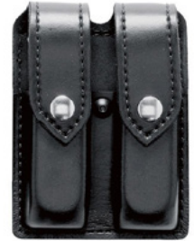
SAFARILAND MODEL 77