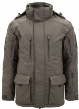
CARINTHIA EXTREME COLD INSULATION CARMENT