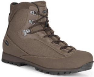
AKU PILGRIM GTX