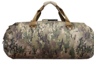
WATERSHED MILSPEC DRY BAGS