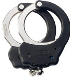
ASP ULTRA CUFFS