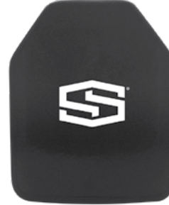
SHOTSTOP DURITIUM III ICW