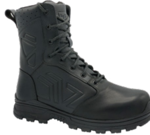
4SYS PUBLIC ORDER BOOT