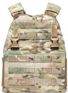
VELOCITY SYSTEMS APC