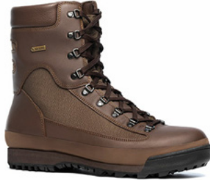
AKU KS LEIGHT GTX