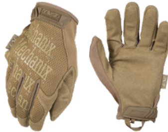
MECHANIX WEAR ORIGINAL