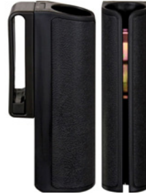
ASP SIDEBREAK SCABBARD