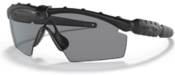
OAKLEY SI BALLISTIC M-FRAME