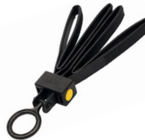
ASP TRI-FOLD RESTRAINTS