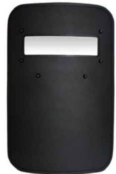
UNITED SHIELD LEVEL III+ LIGHTWEIGHT BALLISTIC SHIELD