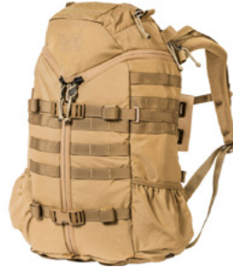
MYSTERY RANCH 3 DAY ASSAULT