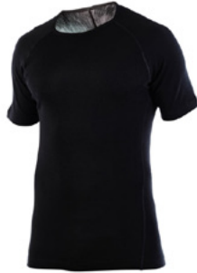
ARMADILLO CONDOR SHORT SLEEVE