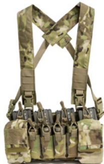
HALEY STRATEGIC D3CRX