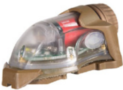
S&S PRECISION MANTA STROBE