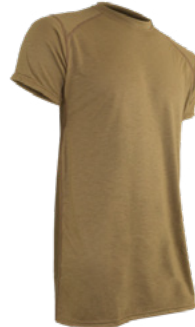
XGO FR PHASE 1 SHORT SLEEVE