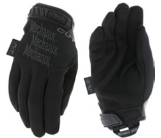
MECHANIX WEAR D5