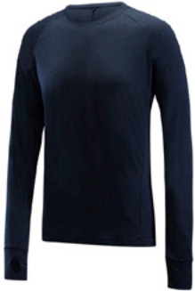
ARMADILLO PANTHER LONG SLEEVE