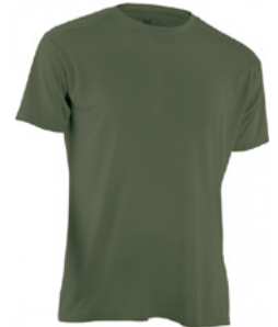
DRIFIRE FR-L1 ULTRA