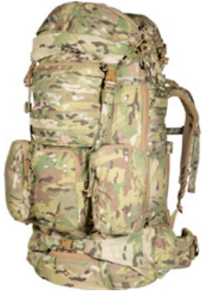
MYSTERY RANCH BLACKJACK 100