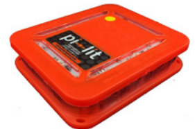
PI-LIT SMART ROAD FLARE