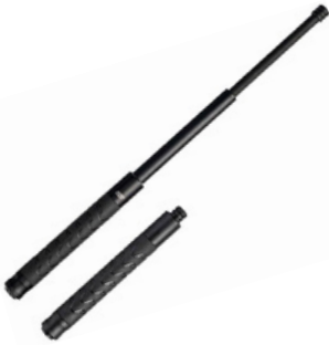
ASP TALON INFINITY BATON