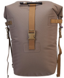
WATERSHED PACK LINER