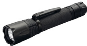
ASP POLY DF - RECHARGEABLE