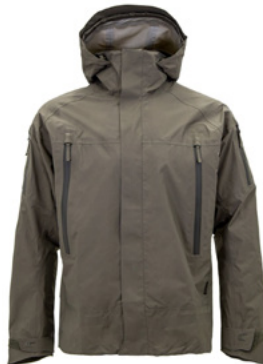
CARINTHIA PRG RAIN JACKET