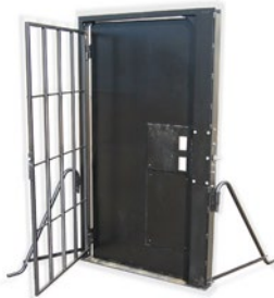
Burglar Door Pry