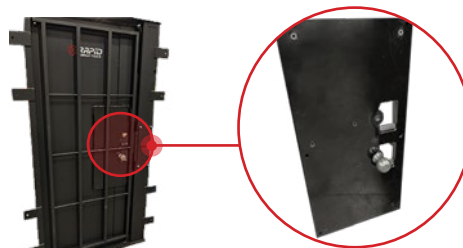
Strike Plate Cover