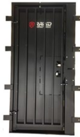
Burglar Door Cut