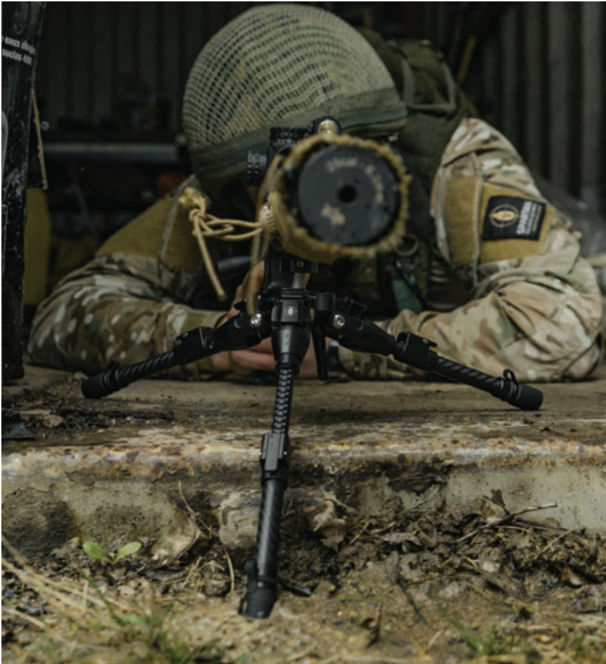
Product Shown: HO-01 - Mini + Disc-Lok M-Lok