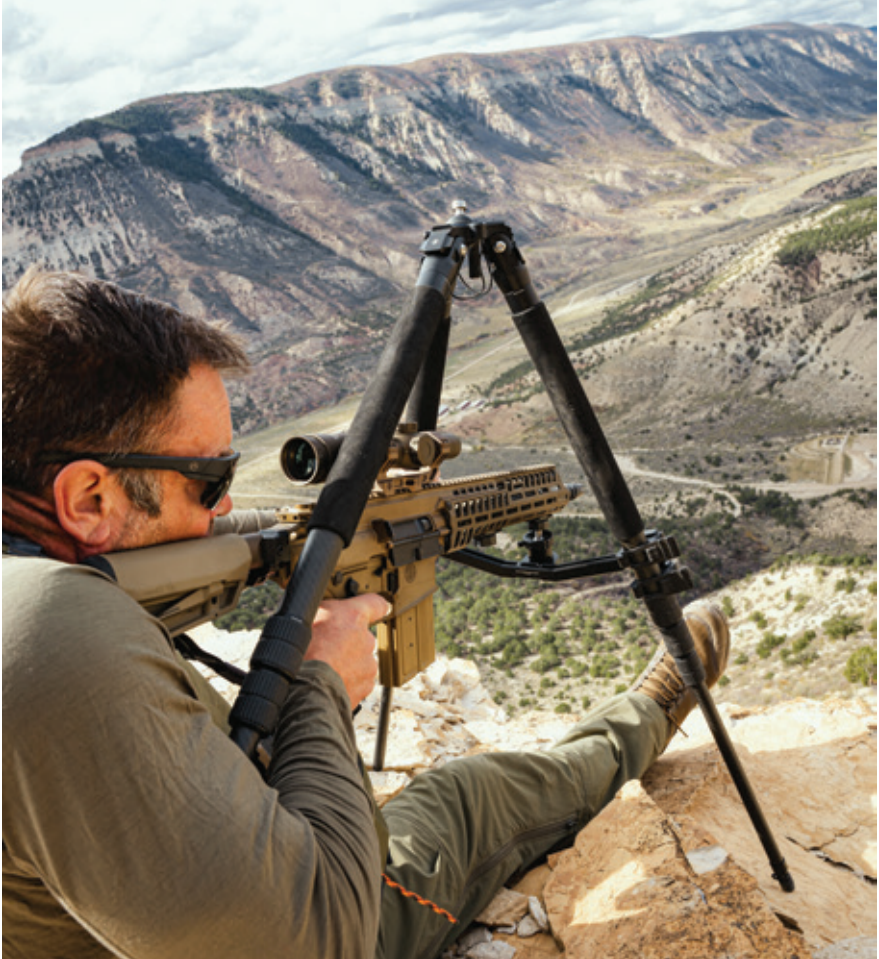
Product shown: HE-01 Tripod.