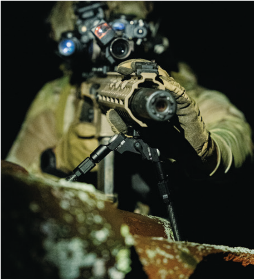
Product shown: VI - 01 + M-Lok